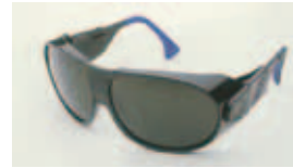
eye and face protection

Examples of PPE used against chemical risk: