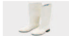
foot and leg protection