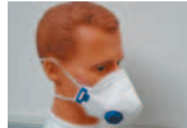
protection of air passages